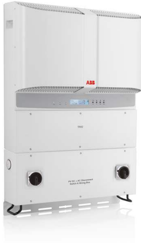
ABB string inverters PVI-10.0-I-OUTD 10kW

Designed for commercial systems, the PVI-10.0, isolated, three-phase inverter is highly unique in its ability to control the performance of the PV panels, especially during periods of variable weather conditions.